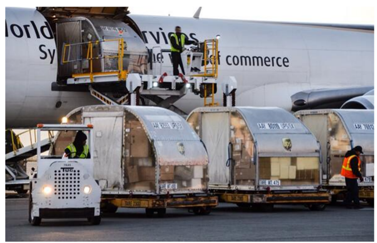
Figure 6: Example standard trucks and associated tugs/dollies