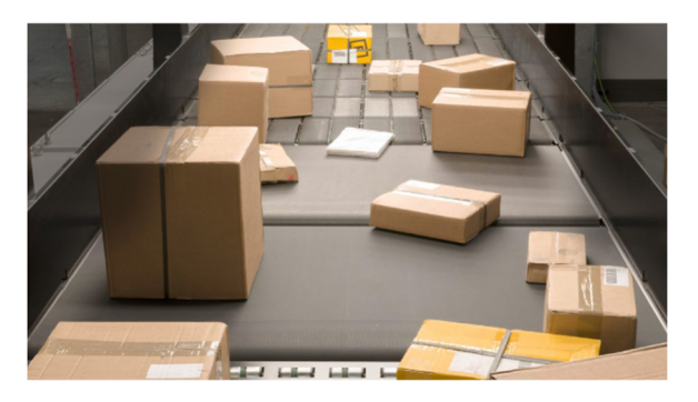
Figure 2: Example Cargo Throughput