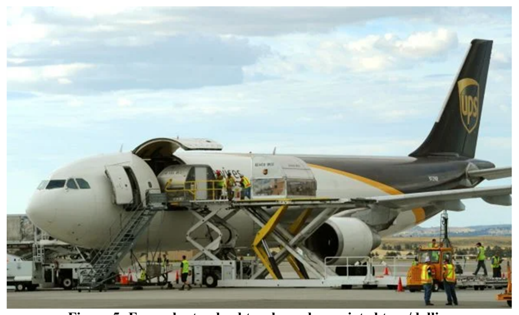
Figure 5: Example standard trucks and associated tugs/dollies