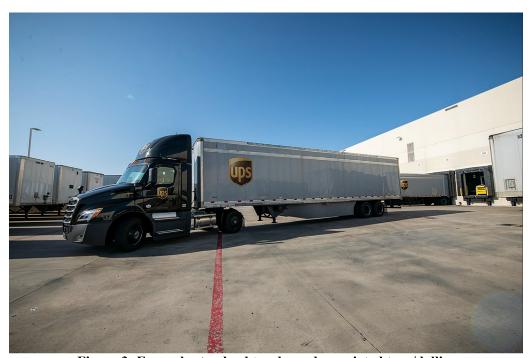
Figure 3: Example standard trucks and associated tugs/dollies