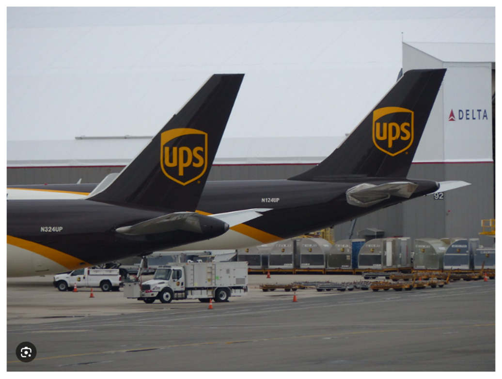
Figure 4: Example standard trucks and associated tugs/dollies