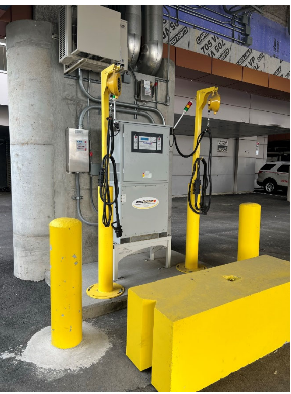
Figure 2: Sample Electrified Ground Service Equipment (eGSE) Dual Charging Stations