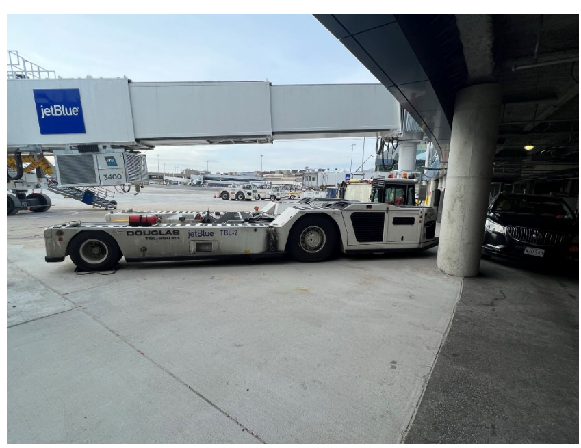
Figure 7: Airline Ground Service Equipment