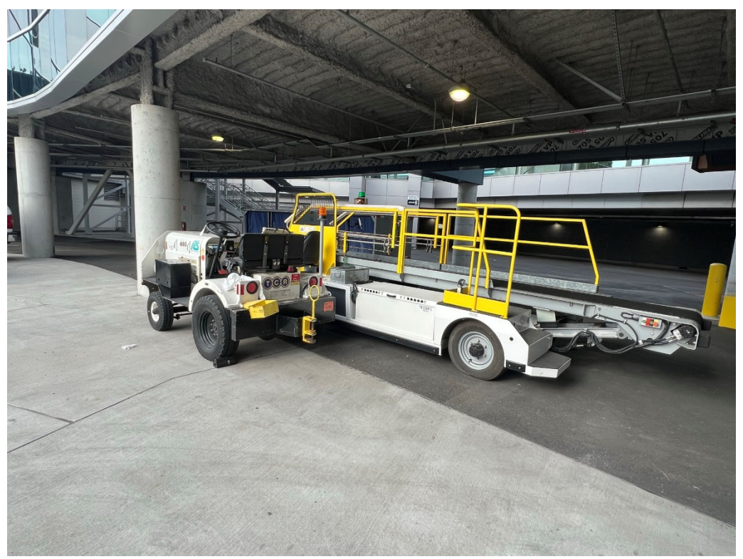
Figure 5: Airline Ground Service Equipment