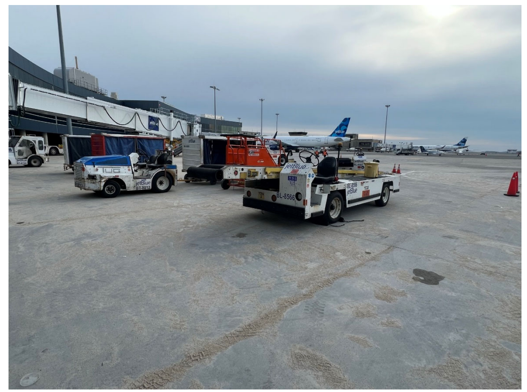
Figure 4: Airline Ground Service Equipment