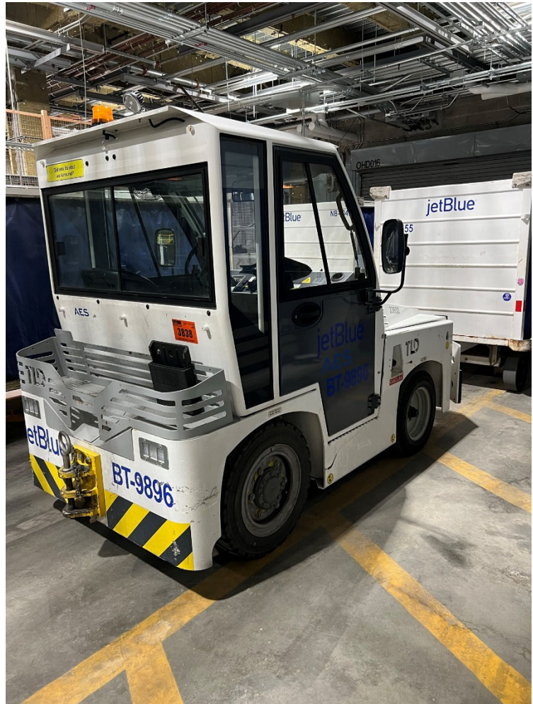
Figure 6: Airline Ground Service Equipment