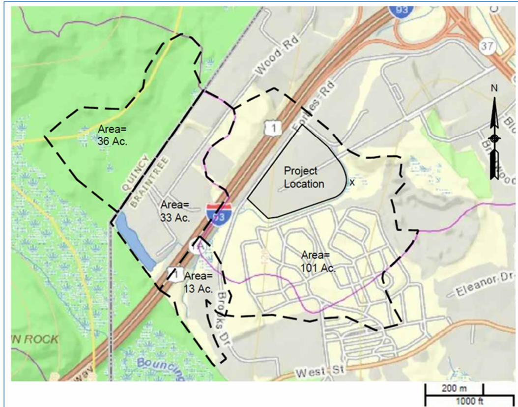
Figure 1: Project Location and Drainage Areas of Existing Site