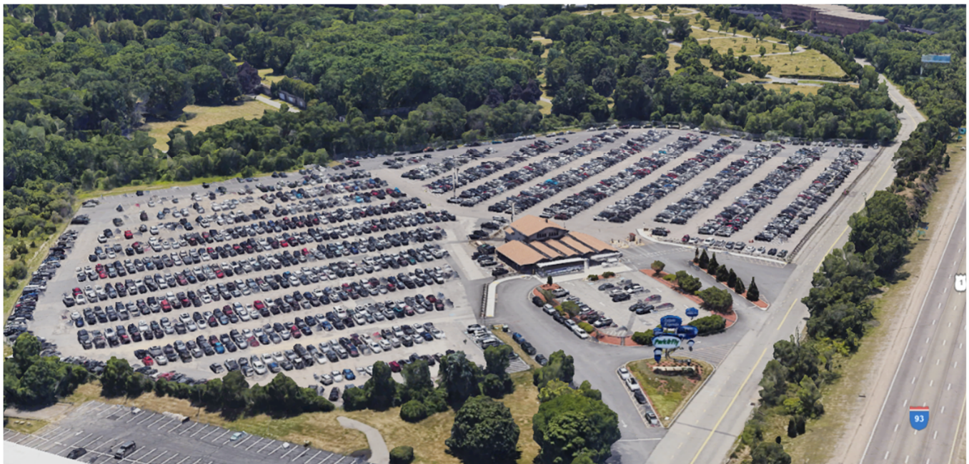
Figure 2: Location of Existing Logan Express Facility and Parking lot in Braintree