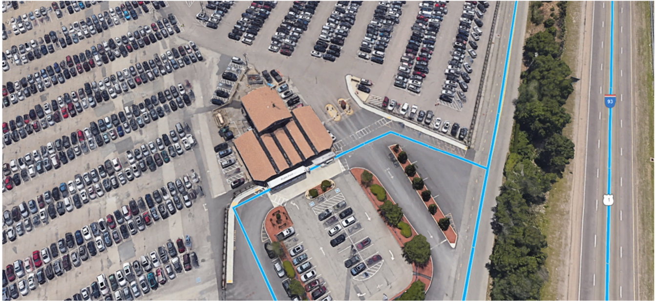
Figure 3: Existing Terminal Facility