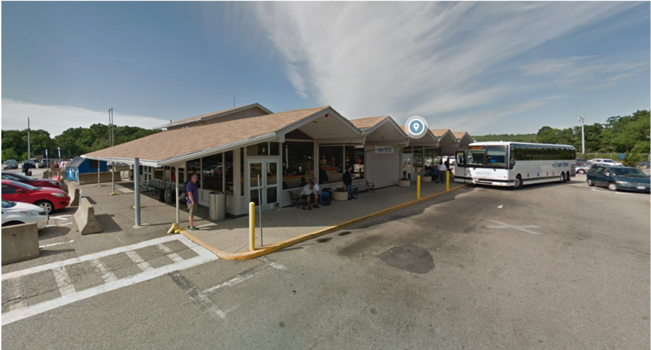
Figure 5: North Elevation of the Terminal facility

The scope of work shall further include, but not be limited to the following: