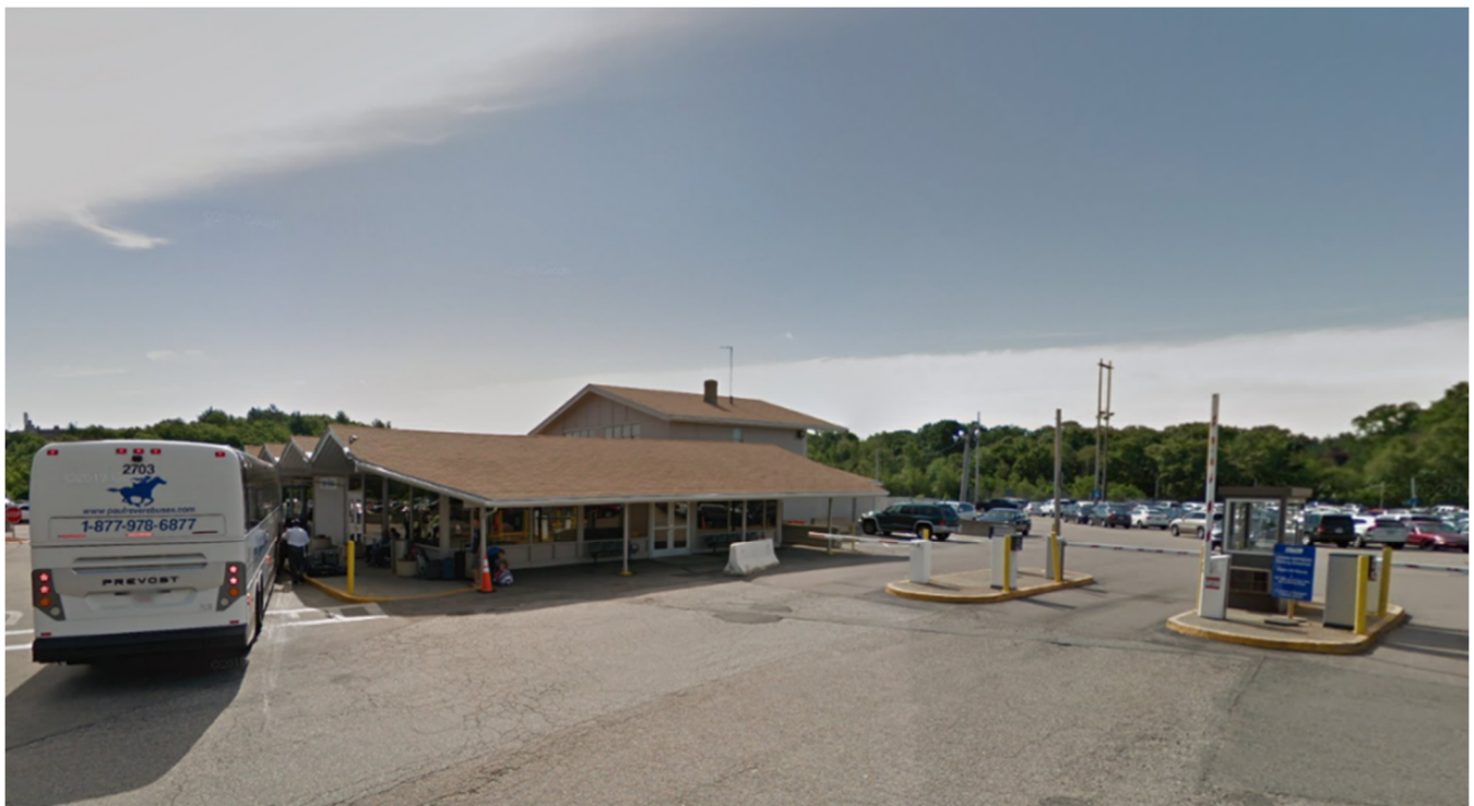
Figure 4: West Elevation of the Terminal Facility