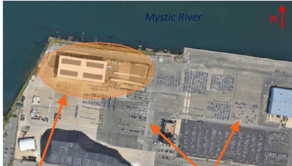
Existing Wind Technology Testing Center

Project Location – 80 Terminal Street, Charlestown MA