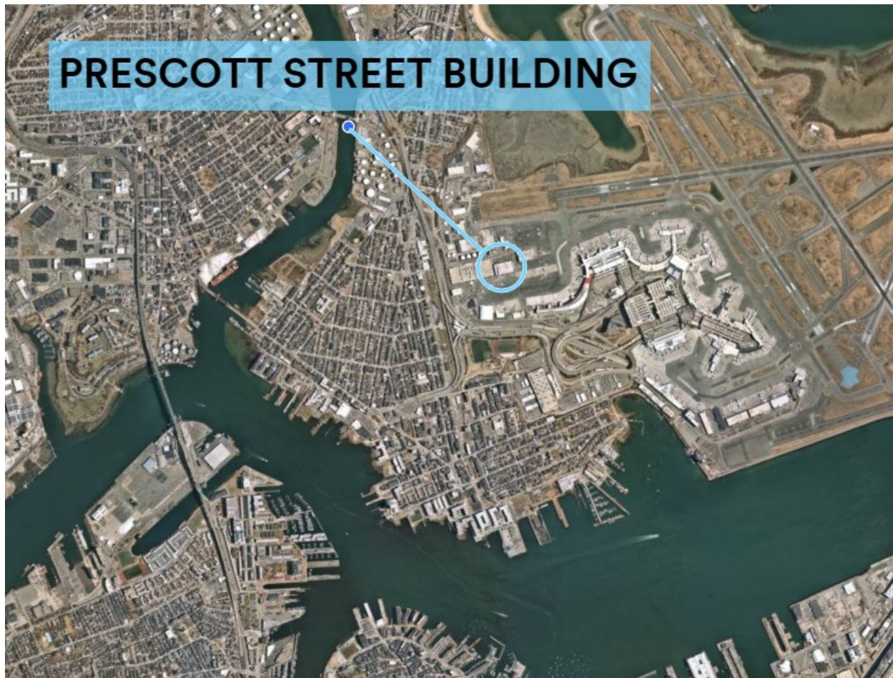
Figure 1 Location of Prescott Street Building at Logan Airport

The consultant shall demonstrate experience in several disciplines including but not limited to Programming, Site Planning for both landside and airside, Architectural including building envelope and interiors, Site Civil, Structural, Mechanical with an emphasis on energy efficiency, Electrical, Plumbing, Vertical Transportation, Landscape Architecture, Code Compliance, Cost Estimating, Construction Phasing, Climate Resiliency and Sustainable Design, Security, Telecommunications Design as well as ADA compliance, and energy efficiency.