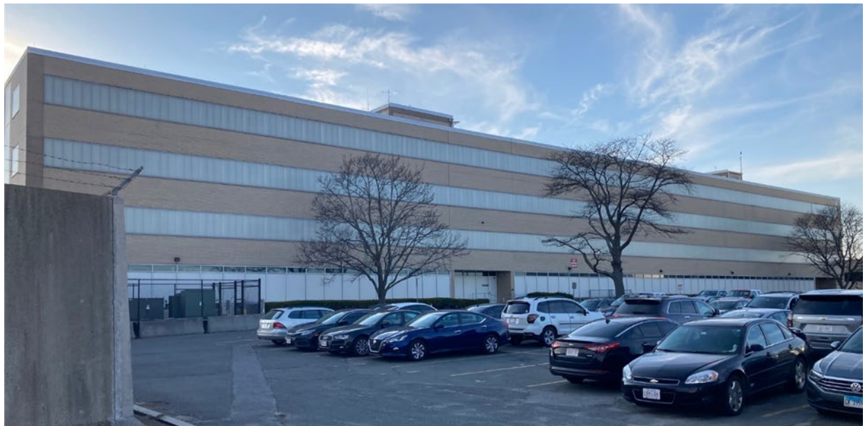
Figure 3 East Elevation of the Prescott Street Building