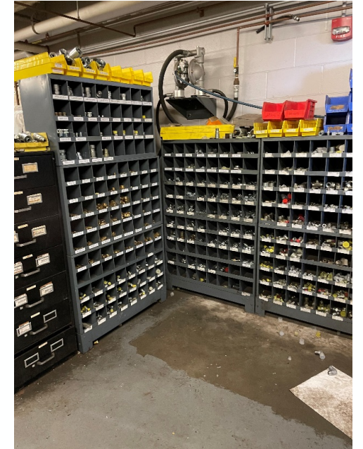
Small Part Storage